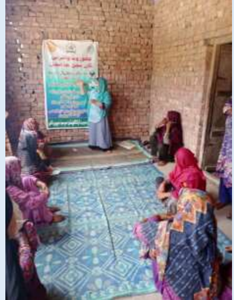
COVID-19 Sessions at Mirpurkhas