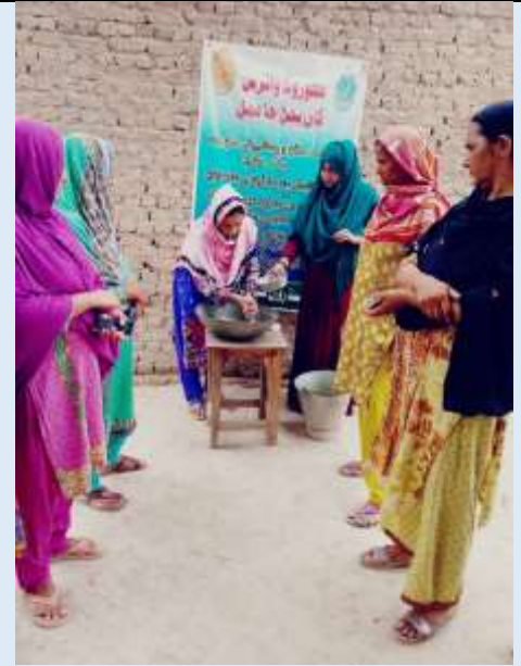
COVID-19 Sessions at Mirpurkhas