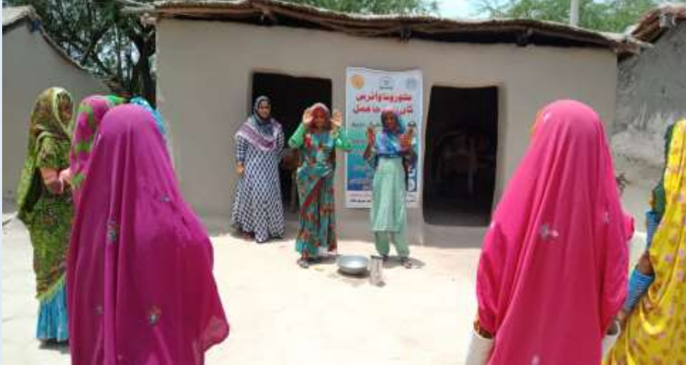
Hand Washing Activity @ District Mirpurkhas