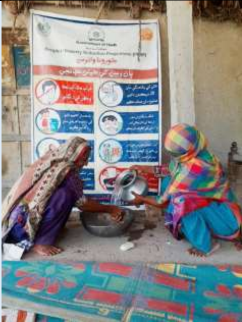
COVID-19 Community Awareness Session and Hand Washing Activity at Badin