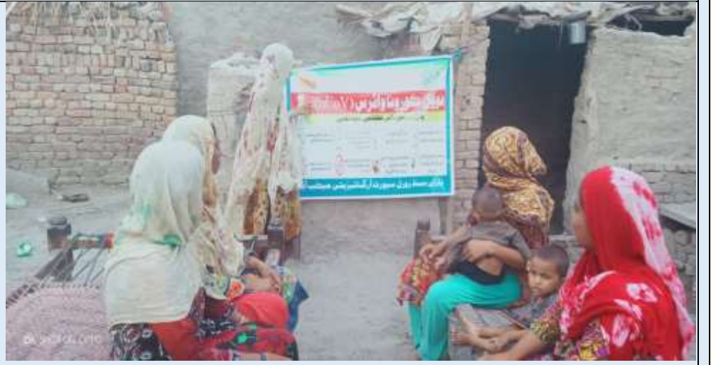
COVID_19 Awareness Sessions at District Jacobabad