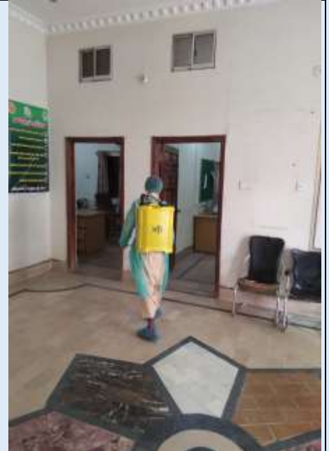
District Office Kharipru was insectiied from the COVID-19 threat with the support of Health Department-District Khairpur The End