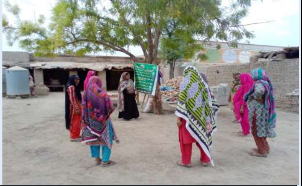
COVID-19 Awareness Session and Social Distancing at Khairpur